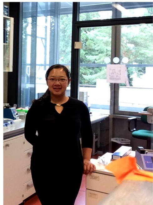
Me in front of the lab bench where I did a lot of pipetting of solutions that I was working with

Zurich, and Paris, among others. I found that the train system was very useful to get around (as was the less expensive FlixBus mode of transportation). I found that these weekend trips accentuated my immersion in German/European culture by providing a different perspective and outlook as well as unique cultural and historical backdrops.